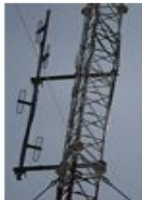
Kohtz (Current) Tower Antennas 120'-180'