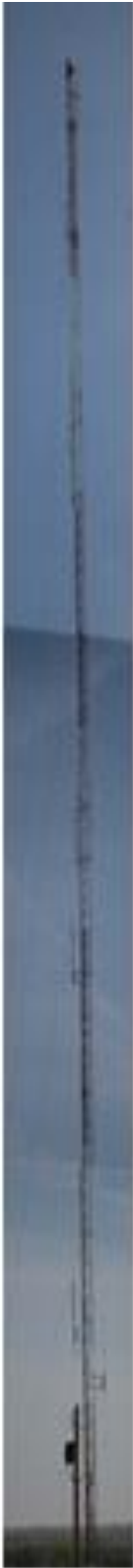
Kohtz (Current) Tower Antennas 250'