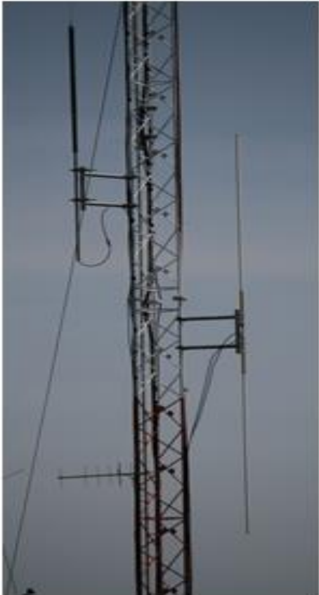
Kohtz (Current) Tower Antennas 40'-60' Paraclete Antennas