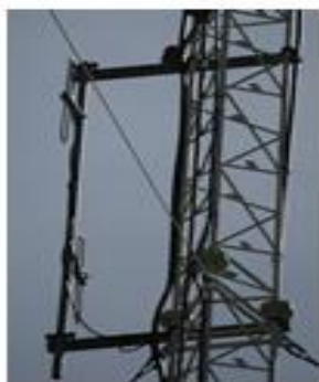
120'-NE LEG-2LOB- VHF ANT